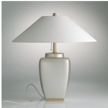
Blattsilber – Silver leaf