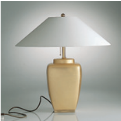
Blattgold – Gold leaf