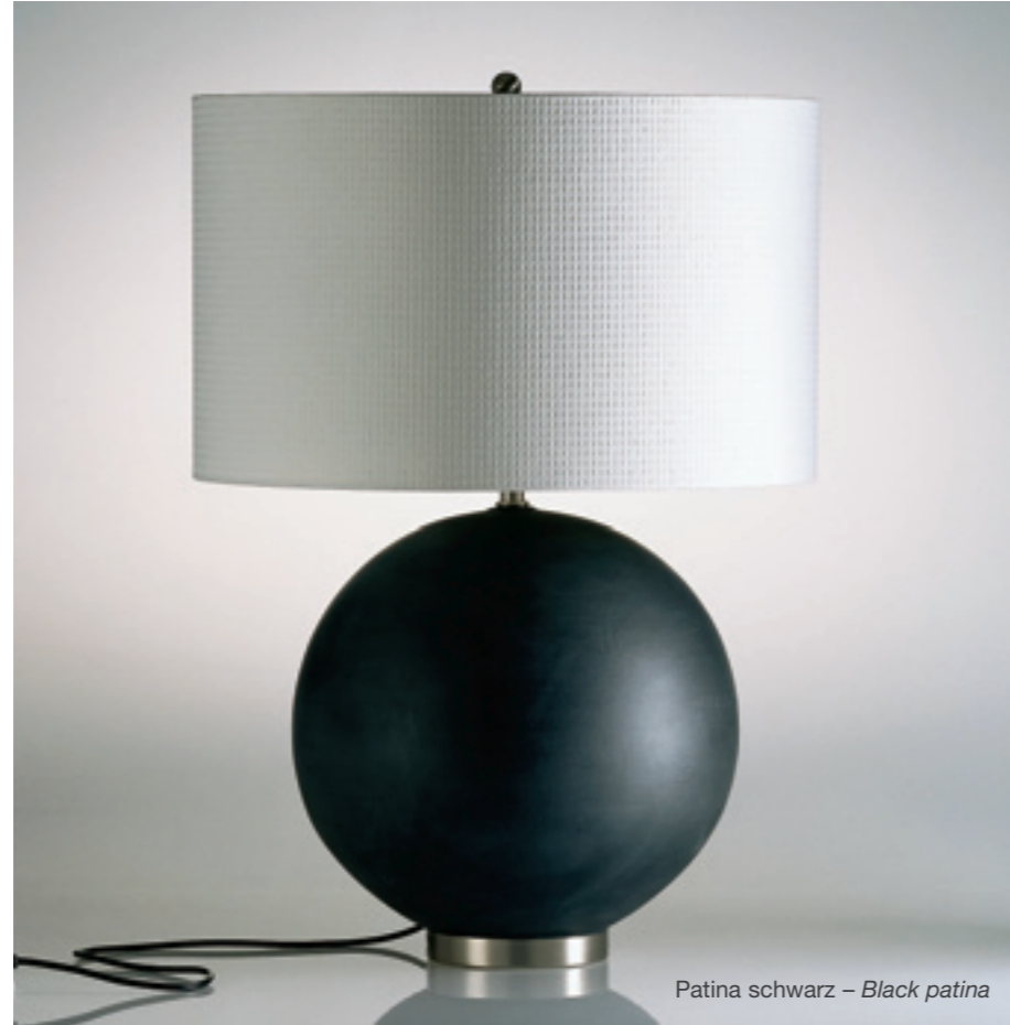
Patina schwarz – Black patina