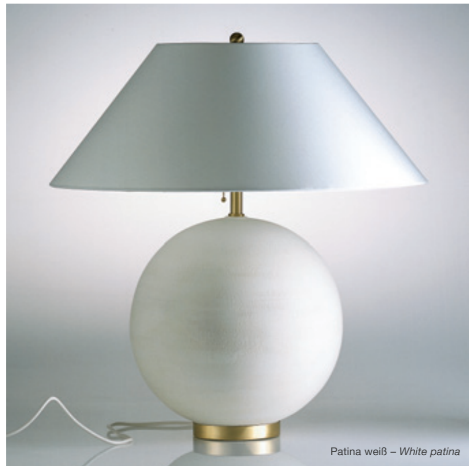
Patina weiß – White patina

Titelseite: Modell GLOBOL creme-perlmutter Front page: Type GLOBOL creame pearl